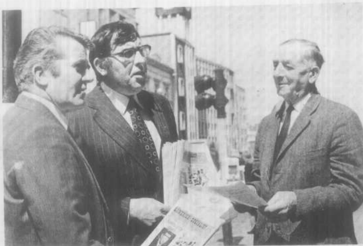
SPREADING THE MESSAGE.

help to elect Limerick's first ever Socialist councillor